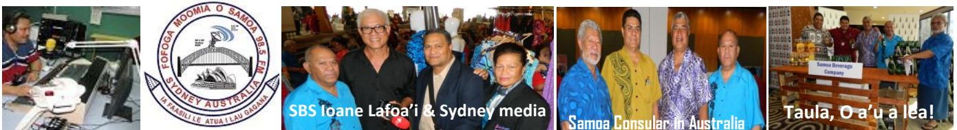
Photo taken inside the studio FM 98.5, old Logo and SAME SHOW CASE at MECURE HOTEL LIVERPOOL ON 23 – 24 OF MARCH 2015 SYDNEY NSW AUSTRALIA